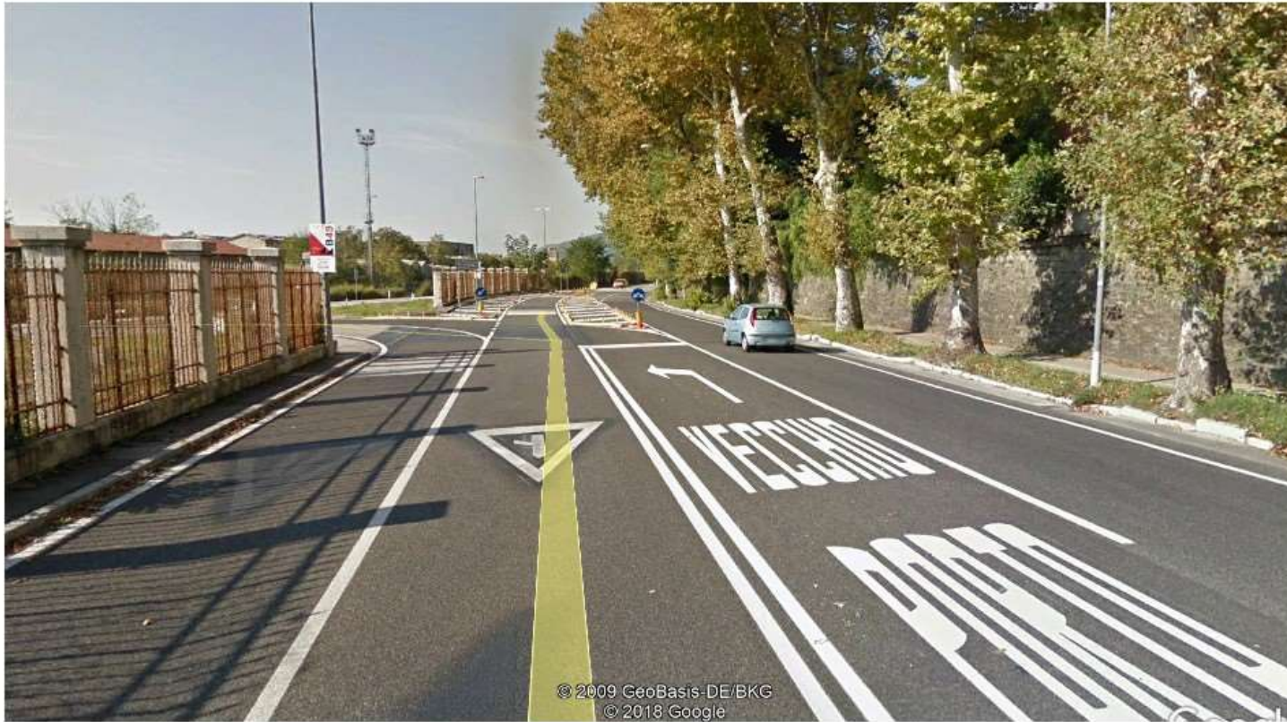
Svincolo per accesso auto Road junction for cars