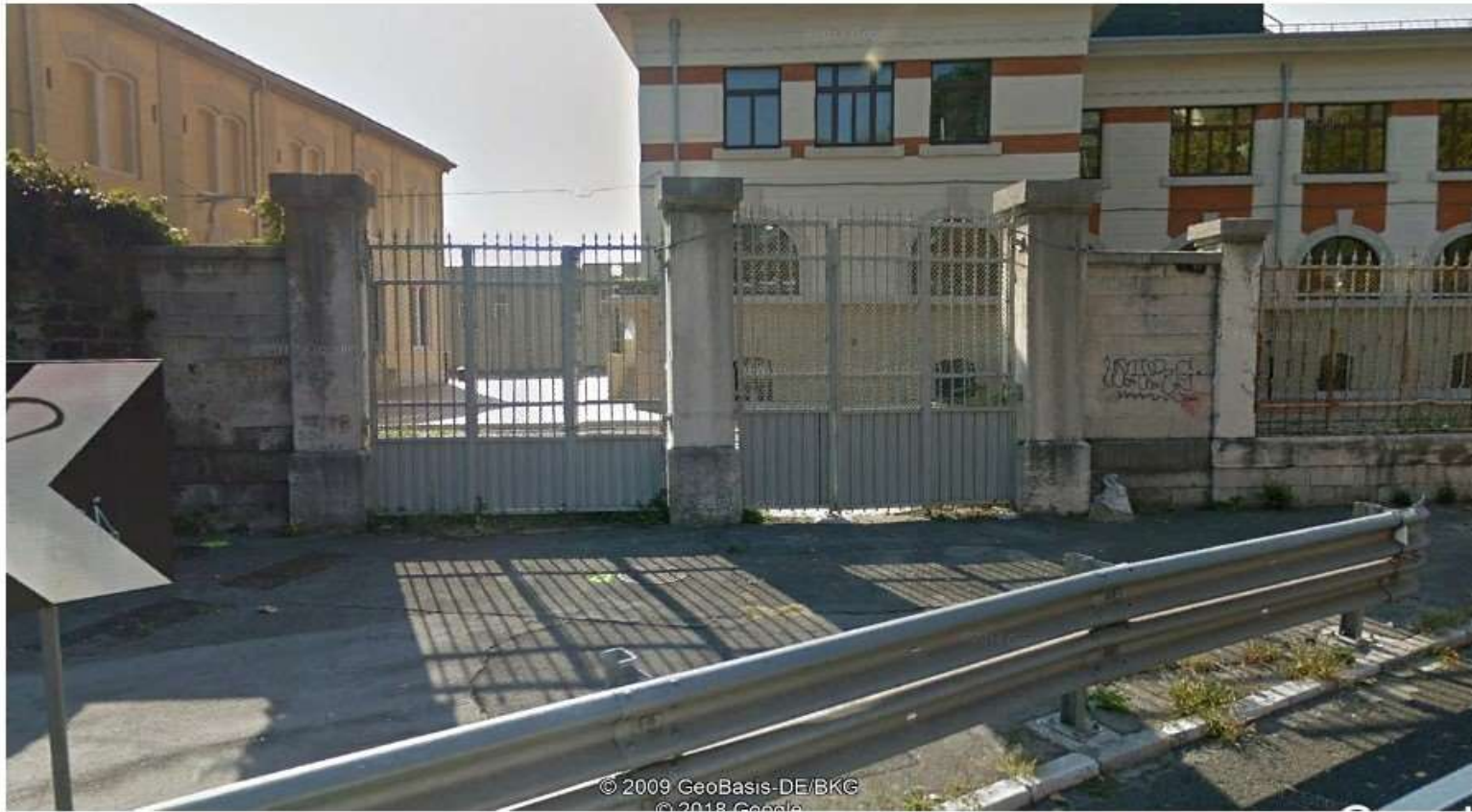
Cancello per pedoni Gate for pedestrians