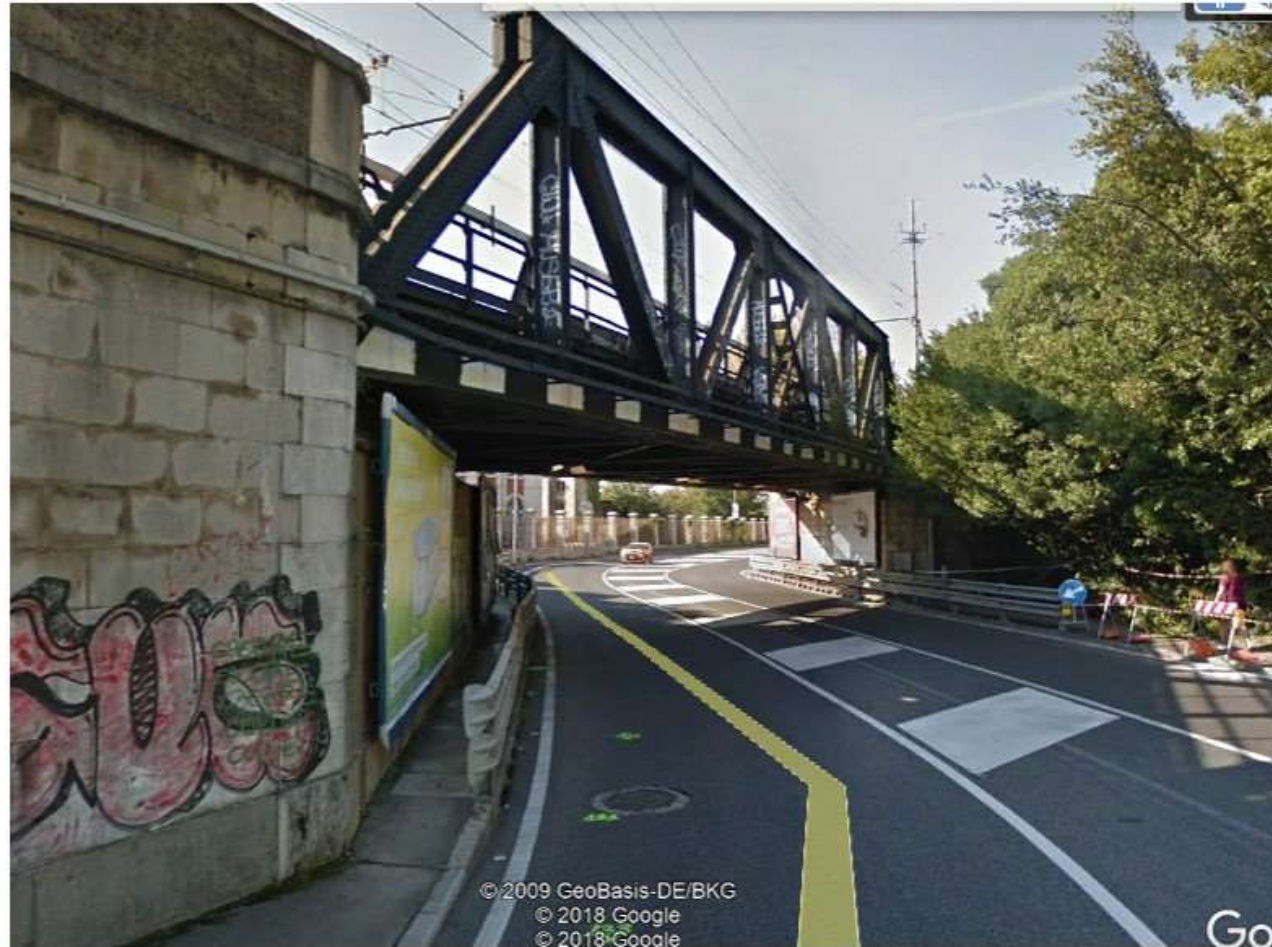
Cavalcavia ferroviario Railway overpass